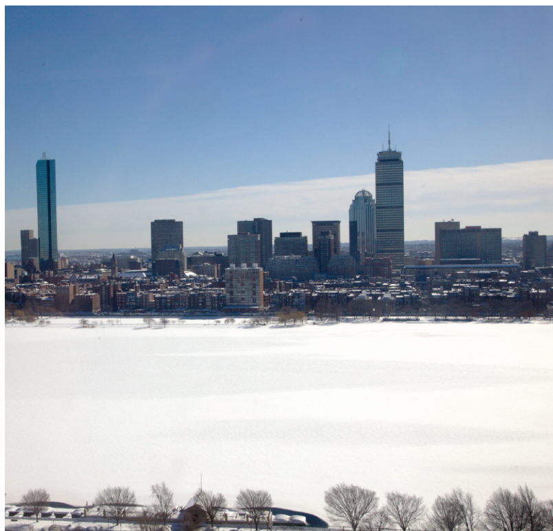
The view from the 18 th floor of Building 54: The home of the Lorenz Center.

We stress that the Lorenz Center focuses on the enormous intellectual challenge of understanding the physics, biology, and chemistry of the climate system. Perhaps ironically, our center, devoted to curiosity-driven research, may stand the best chance of solving what may be the greatest practical challenge of our generation.